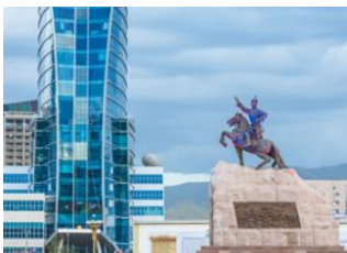
Ulan Bator 📍