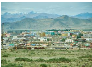
Ulan Bator 📍 ✈️ 1500km - ⌚ 1h 30m Khovd 📍