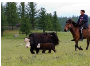
Shuranga river 📍 35km - ⌚ 6h Orkhon valley 📍