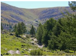
Naiman nuur 📍 30km - ⌚ 5h Boorgiin Oroï 📍