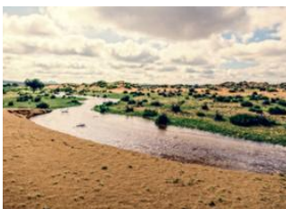
Orkhon valley 📍 🚗 240km - ⌚ 4h 30m Khogno Khan 📍