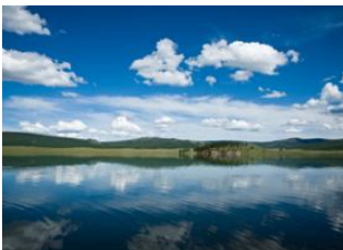
Zuun lake 📍 🚗 130km Moron 📍 🚗 130km Alag Tsar 📍