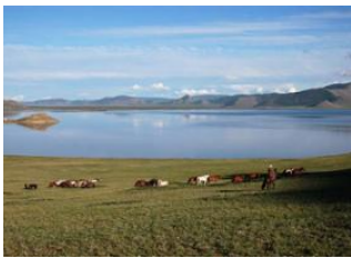
Suman river 📍 20km - 🕒 4h Tariat 📍