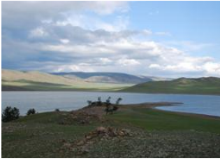
Terkhiin Tsagaan national park 📍 🚗 180km Zuun lake 📍