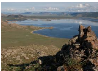
Tariat 📍 30km - 🕒 5h Terkhiin Tsagaan national park 📍