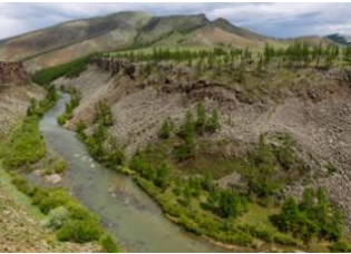
Khanui River 📍 38km - ⌚ 6h Chuluut river 📍