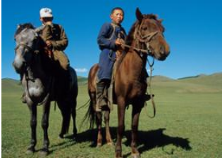
Agt valley 📍 25km - ⌚ 5h Burgat 📍