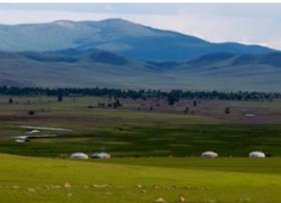
Chuluut river 📍 20km - ⌚ 4h Suman river 📍