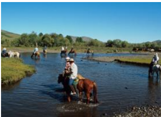
Burgat 📍 33km - ⌚ 5h 30m Khanui River 📍